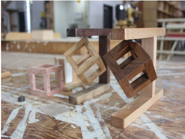
Ed Laber's Floating Walnut Cube

Ed brought a “floating” cube made from walnut, finished with poly.