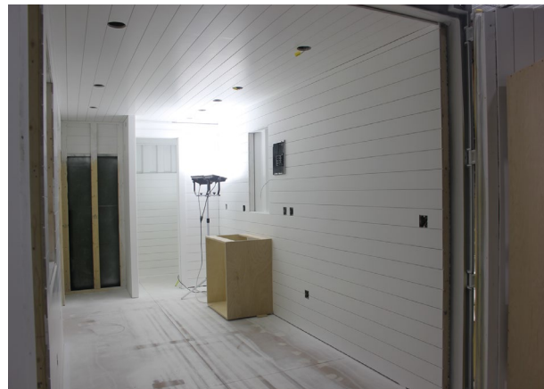
Build For Hope Tiny Home