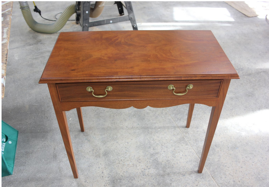
Chris Cook's Mahogany Side Table

Chris displayed a mahogany side table finished with homemade stain, shellac and lacquer.