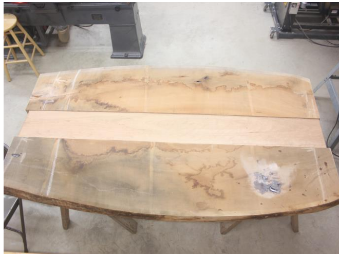
Lindsey Smith's Curved Live Edge Cherry Table

Lindsey gave a progress report on a dining room table made from consecutive cherry slabs. The table will have a unique appearance when finished due to very significant curvature of the tree from which the slabs were taken. The width of the table will be 44" at its center, curving to 38" at each end.