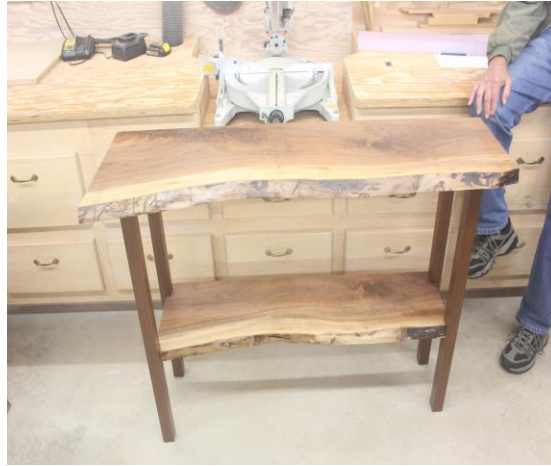
Wayne Rendell's Walnut Hall Table

Wayne showed a hall table made from consecutive walnut slabs with live front edges. Wayne's wife was very happy with the result!