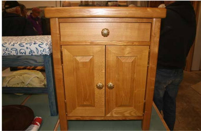
Lindsey Smith's Mulberry Table

Lindsey brought a small table/cabinet combination made from mulberry. The piece featured hand cut dovetails in the drawer and extensive use of floating panels in the doors, walls, floor, and top.