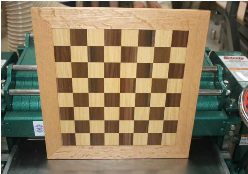
Lindsey Smith's Chess/Checkers/Writing Board

Lindsey brought a chess/checkers/writing board made from walnut, oak and elm. The board squares were all glued together with the grain running in the same direction and “floated” within the oak frame. The finish is satin wipe-on poly.