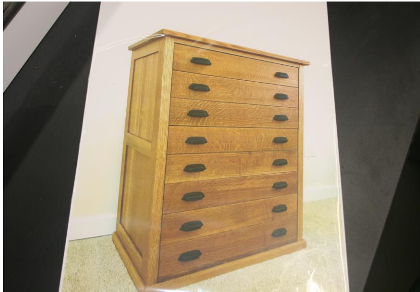
Chris Cook's Arts & Crafts Style Case

Chris displayed a photograph of an eight drawer Arts & Crafts style case. It is made from quarter-sawn white oak and is finished with Danish Oil and paste wax. The piece includes Blum soft-close undermount slides for the drawers and solid brass pulls and will be used to store a wood sample collection. The drawers are made from sassafras.